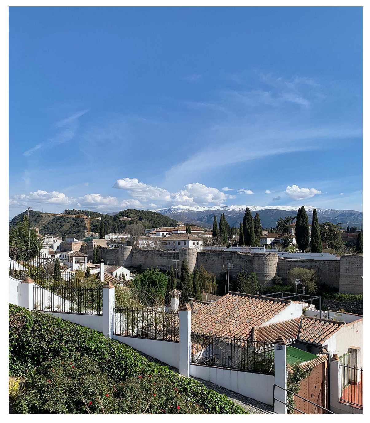
Fig. 4. The Sierras. A view across part of the outskirts of Granada, across the city wall and onto snow-capped Sierra Nevada mountains.

metazoan counterparts, encoded by a combination of mitochondrial and nuclear genes and possess a considerable cohort of accessory proteins (Čermáková et al. , 2021). As complex I of T. brucei is nonessential in both BSF and procyclic form, it is a possibility that the complex is modified or lost in other species. Significantly, complex II can act as the major entry site for electron flow through the respiratory chain. Complex I composition is highly variable across the trypanosomatids, and as shown in the paper here, in monoxenous parasites, i.e. those that have only insect hosts, there are novel proteins indicating significant diversity and likely accounting for differential sensitivity towards classic inhibitors, such as rotenone.