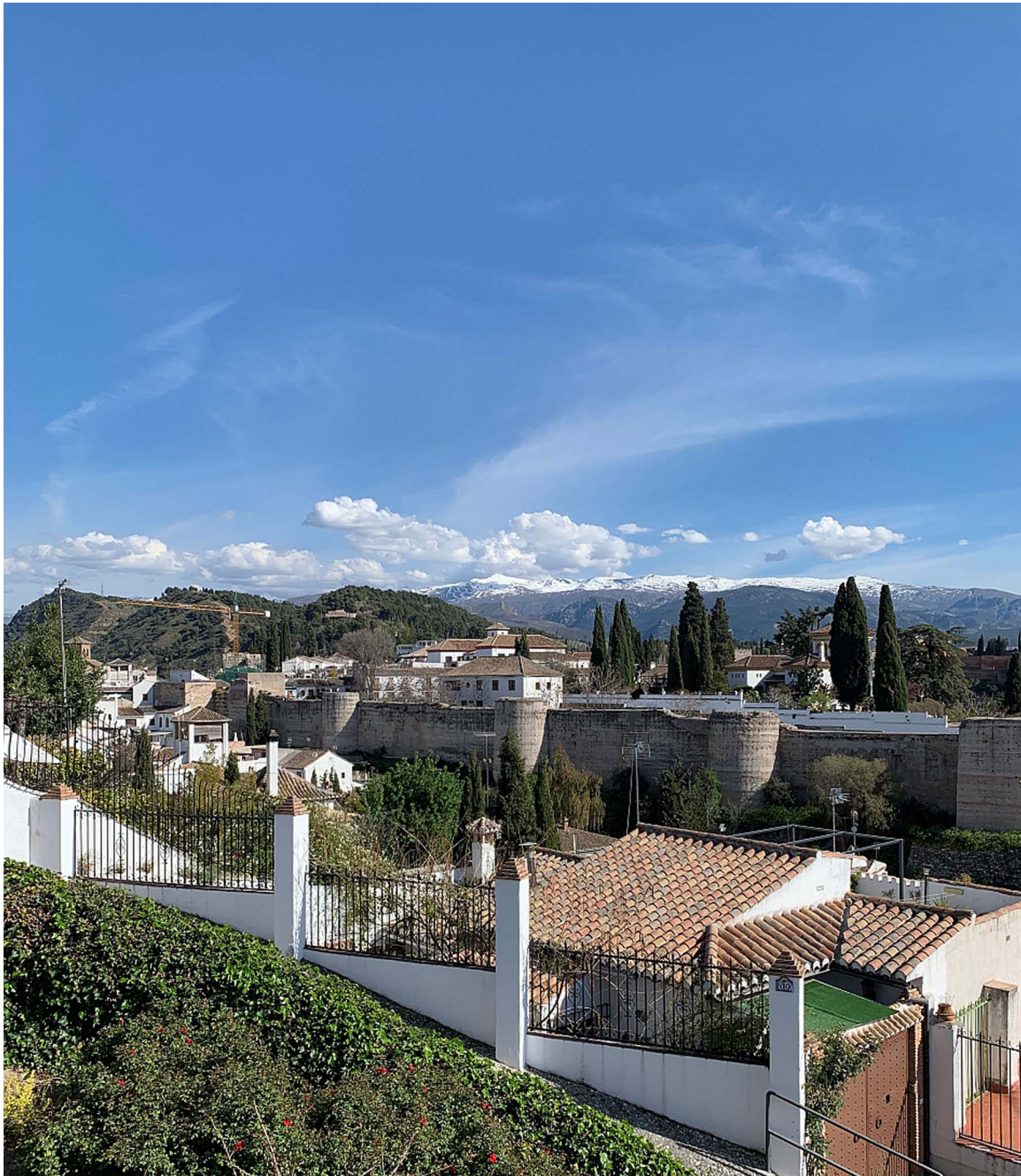
Fig. 4. The Sierras. A view across part of the outskirts of Granada, across the city wall and onto snow-capped Sierra Nevada mountains.

metazoan counterparts, encoded by a combination of mitochondrial and nuclear genes and possess a considerable cohort of accessory proteins (Čermáková et al. , 2021). As complex I of T. brucei is nonessential in both BSF and procyclic form, it is a possibility that the complex is modified or lost in other species. Significantly, complex II can act as the major entry site for electron flow through the respiratory chain. Complex I composition is highly variable across the trypanosomatids, and as shown in the paper here, in monoxenous parasites, i.e. those that have only insect hosts, there are novel proteins indicating significant diversity and likely accounting for differential sensitivity towards classic inhibitors, such as rotenone.